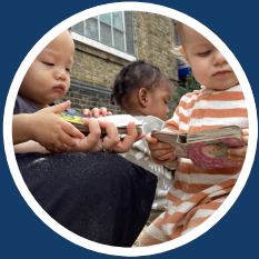
Baby Dragons 12-24 MONTHS