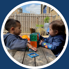
Blue Dragons 22-36 MONTHS